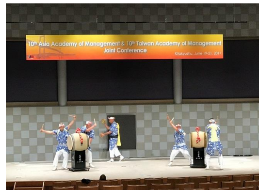
Kokura Gion Japanese Drum