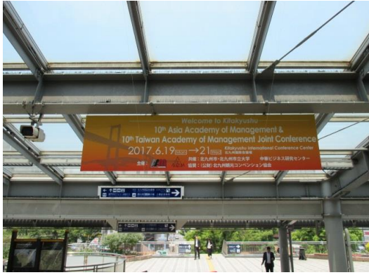
Signboard at Kokura station