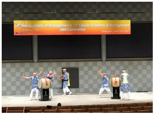
Kokura Gion Japanese Drum