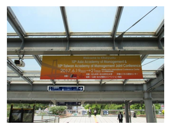
Signboard at Kokura station